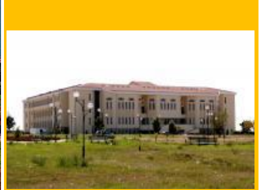
Campus 1 Ovidius University of Constanta